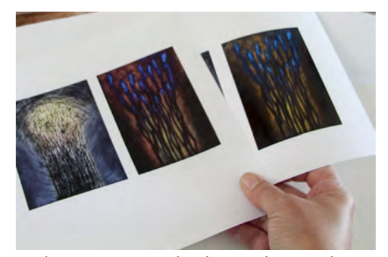
Each artist corrected colors in their studio

studios. Any necessary color corrections were made by each artist before sending the digital files out for printing. This created a consistent set of proof prints so that any corrections needed could be applied on the press globally.