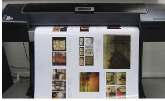
Proofing images on HP Designjet Z3200

The artists each selected work to feature in the book and gathered the necessary photos. To accurately proof colors in three remote locations, each artist printed their photos on HP Instant-dry Gloss Photo Paper on the HP Designjet Z3200 Photo Printer in their