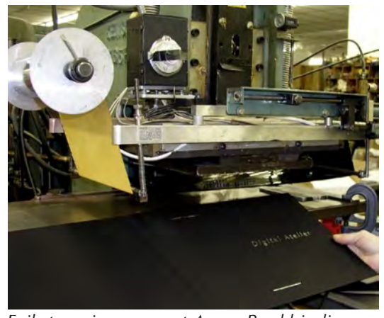
Foil stamping cover at Acme Bookbinding

For the limited edition boxed set, black anodized aluminum Olema boxes by Pina