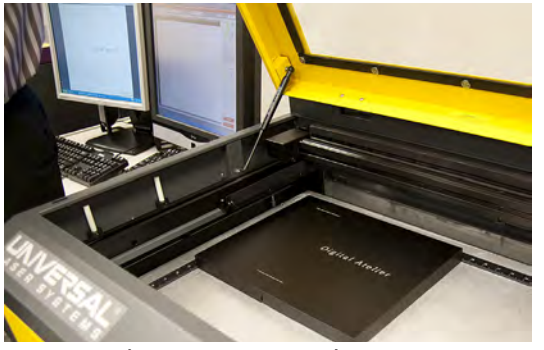
Engraving boxes at Universal Laser System

Zangaro were selected. Titles were engraved onto the boxes by Universal Laser Systems.