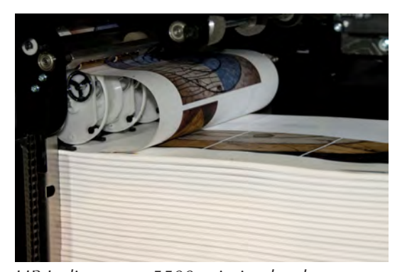
HP Indigo press 5500 printing books

The press chosen to print the book, HP Indigo press 5500, can accommodate several paper types simultaneously, so three separate papers were selected for the book. For translucent overlays and decorative endpapers, the artists chose two papers from The Papermill; Glama Natural® Digital Clear 40# bond and Aspire Petallics Silver Ore