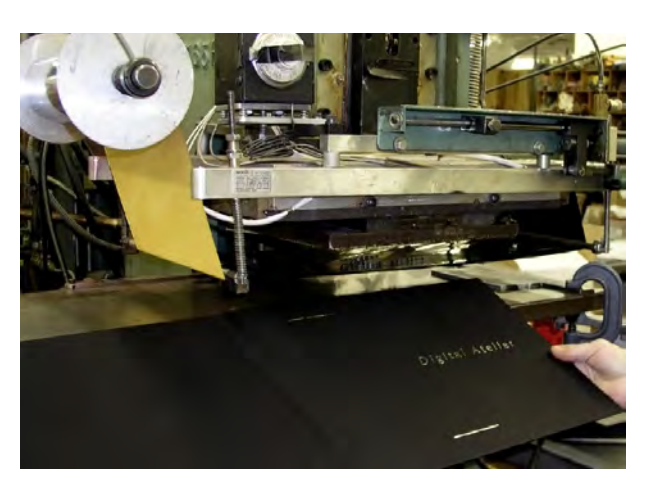
Foil stamping cover at Acme Bookbinding

book. The 11-1/4 x 14" case binding is covered with Sierra book cloth, a natural finish rayon fabric with the title foil stamped on the front cover and spine. The 3 pieces of art were placed in their respective portfolio wrap and all components were assembled with the bound book in the engraved box.