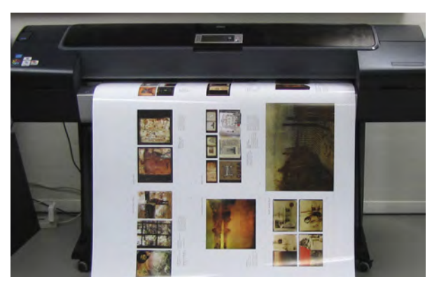
Proofing images on HP Designjet Z3200

From their studios near Boston, Denver and Seattle, the artists each selected work to feature in the book and gathered the necessary photos. To accurately proof colors from their three remote locations, each