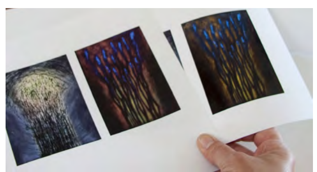
Each artist corrected colors in their studio

artist printed their photos on HP Instant-dry Gloss Photo Paper on the HP Designjet Z3200 Photo Printer in their studios. Color corrections were made by each artist before sending the digital files out for printing. This created a consistent set of proof prints