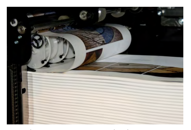
HP Indigo press 5500 printing books

Tim Mullen of Pina Zangaro, makers of the aluminum box, says "We offer a family of archival, scratch resistant boxes that can be used to store, transport and present this new generation of on-demand books. An elegant storage solution can open opportunities to add additional elements and increase the value of the product as perfectly demonstrated by this book."